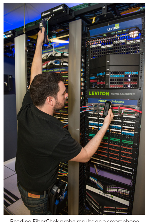
Reading FiberChek probe results on a smartphone