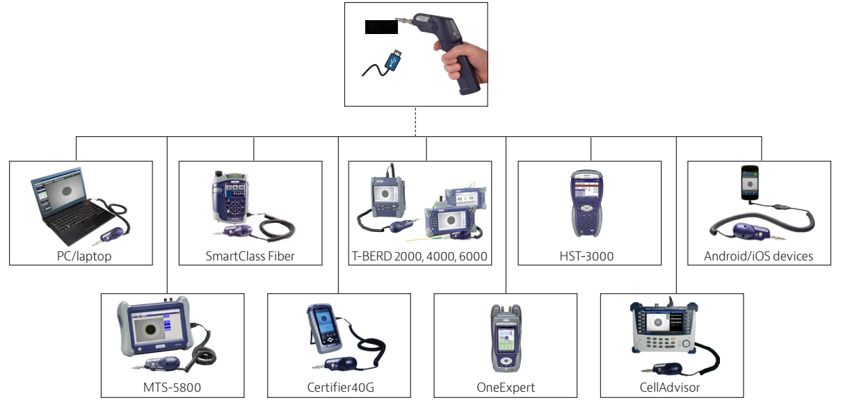
Connectable VIAVI devices include: SmartClass™ Fiber family, T-BERD®/MTS family, OneExpert™ (ONX) family, CellAdvisor®, Certifier40G™, and MP-60 optical power meter

As an all-in-one inspection solution, the FiberChek probe rarely needs to connect to other devices. However, many technicians already use other devices as part of their testing and do not want to disrupt their existing workflows. That's why FiberChek integrates with other VIAVI test devices to significantly improve productivity when you use them together. FiberChek can function independently of another test device, saving time by letting technicians test their next ports while an existing test is still in process.