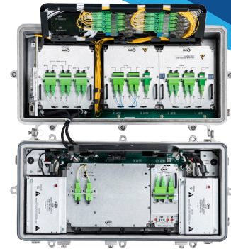
Chassis (open view)