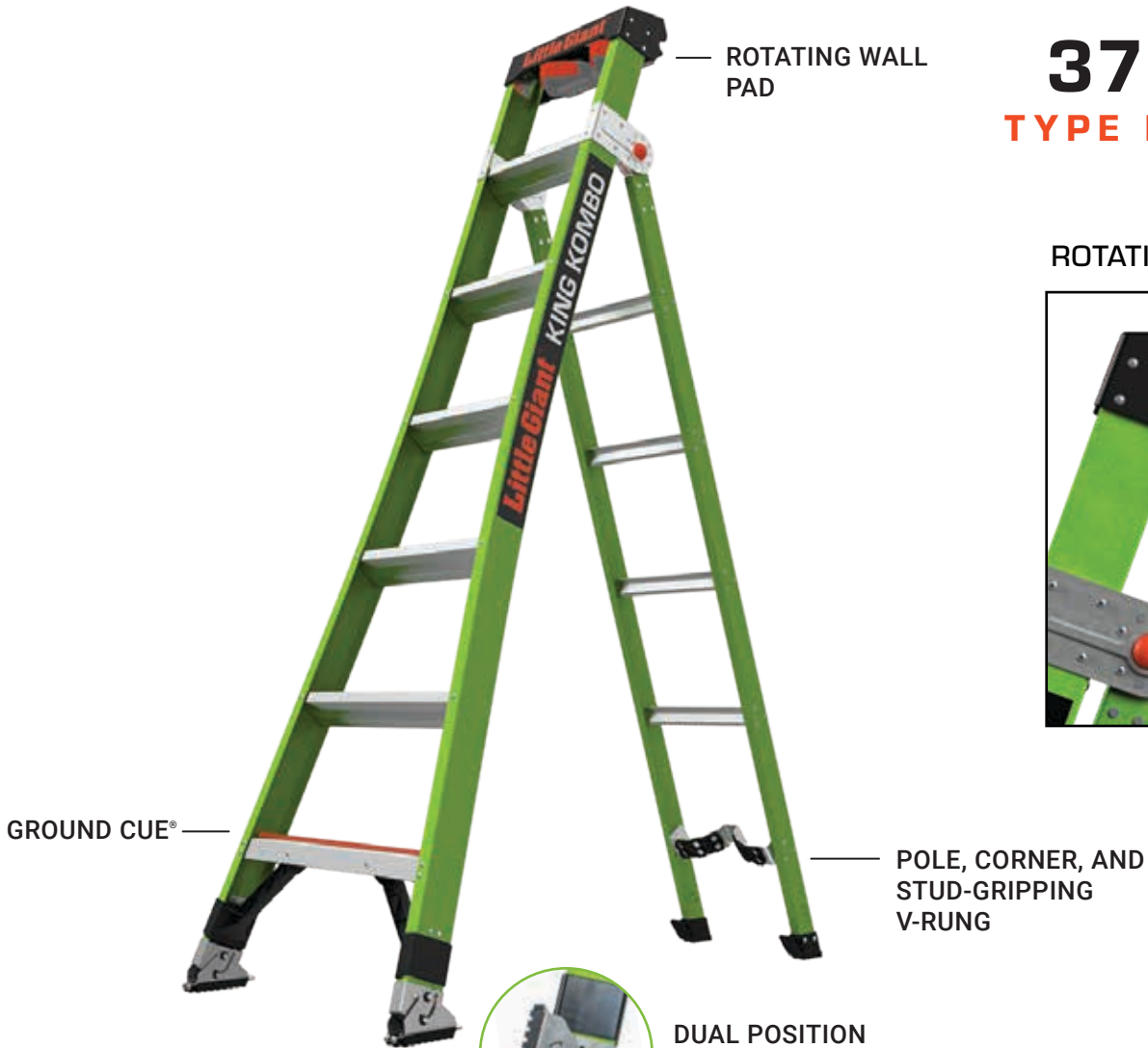
ROTATING WALL PAD